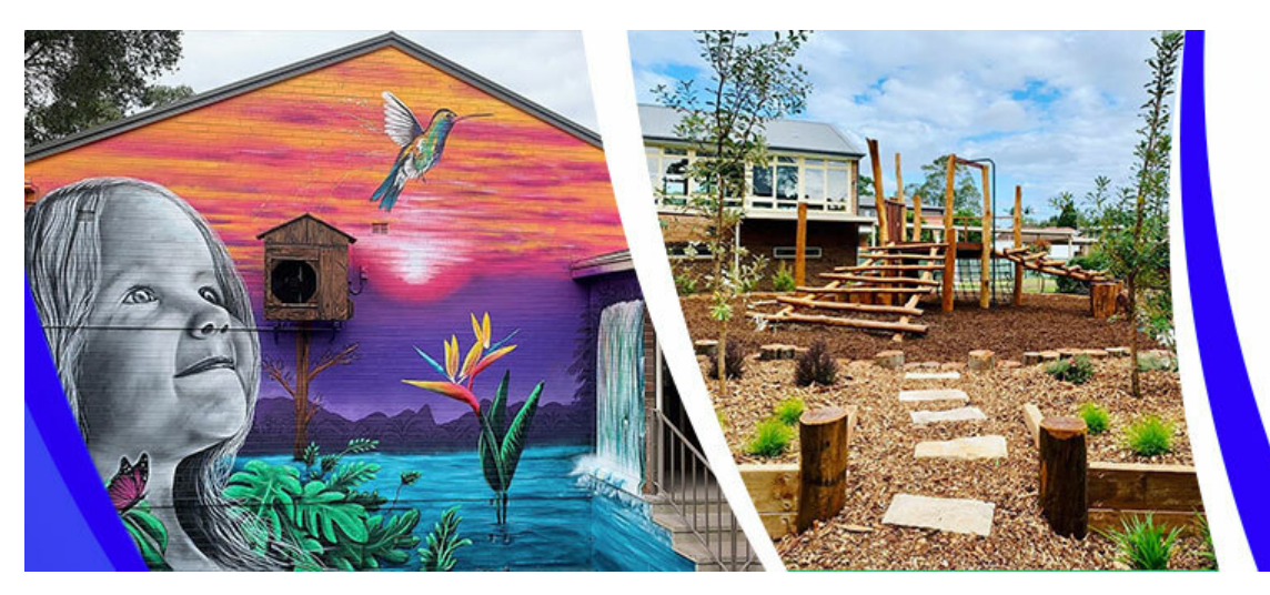
11 Union St Riverwood NSW 2210 Subscribe: https://riverwoodps.schoolzineplus.com/subscribe

Email: riverwood-p.school@det.nsw.edu.au Phone: 02 9153 8757